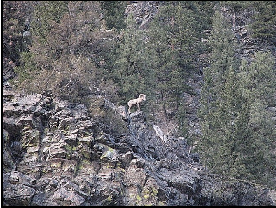
Bonner bighorn sheep ram photographed on the Wisherd property, Spring 2009.